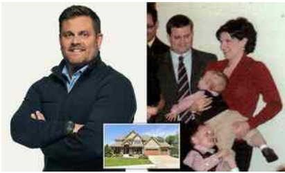
Brian Thompson marriage secret revealed after CEO killing in NYC