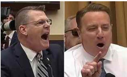
Republican lawmaker EXPLODES at Secret Service boss

The California Highway Patrol is currently the lead agency in the crash investigation.