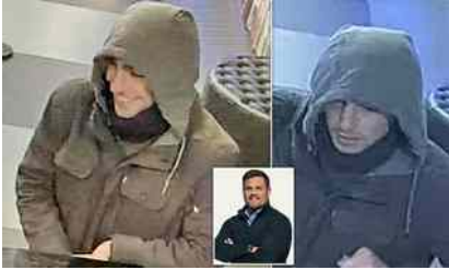
First picture of healthcare CEO's smirking assassin without his mask